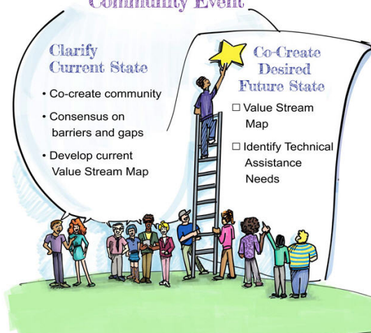
A Two-day Process Improvement Event